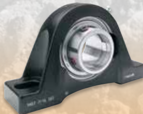
BALL BEARING HOUSED UNITS Easy Installation, A Wide Range of Options