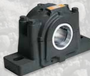
SAF PILLOW BLOCKS Optimal Load Capacity, Extended Service Life