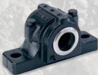
SNT SPLIT PLUMMER BLOCKS Customizable Solution, Uptime Efficiency