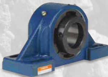
SPHERICAL ROLLER BEARING SOLID-BLOCK HOUSED UNITS Heavy-duty Protection, High Performance