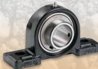
UC-SERIES BALL BEARING HOUSED UNITS Optimized Performance, Industry Standard Configurations