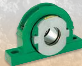
REVOLVE SPLIT ROLLER BEARING HOUSED UNITS Split to the Shaft for Faster Fitting, Reduced Downtime