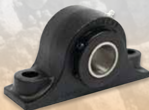
TYPE E TAPERED ROLLER BEARING HOUSED UNITS Improved Reliability, Enhanced Performance