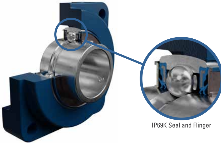
IP69K Seal and Flinger