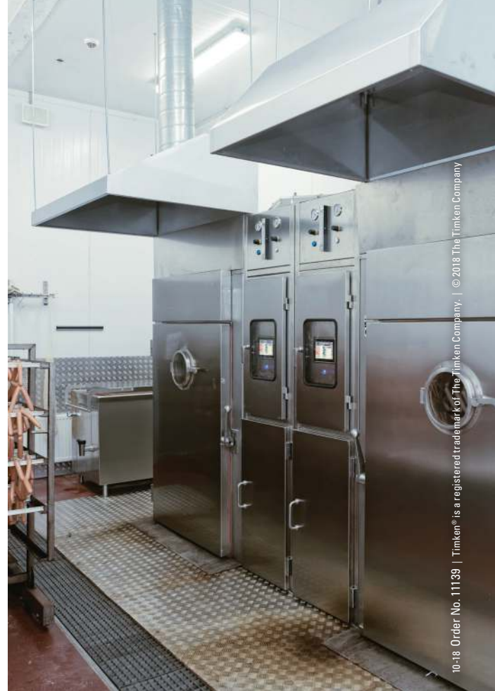
10-18 Order No. 11139 | Timken® is a registered trademark of The Timken Company. | © 2018 The Timken Company